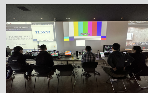
Remote destination (Tokyo)

As part of our efforts in Connected Media, we have been jointly developing a remote production system with TOKYO BROADCASTING SYSTEM TELEVISION, INC. since 2019.