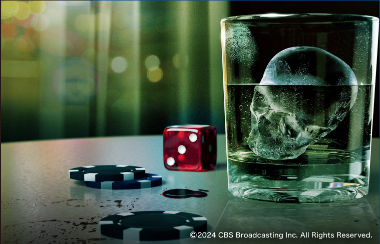
CSI: Vegas Season3