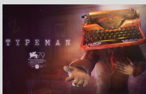
Typeman WOWOW × CinemaLeap