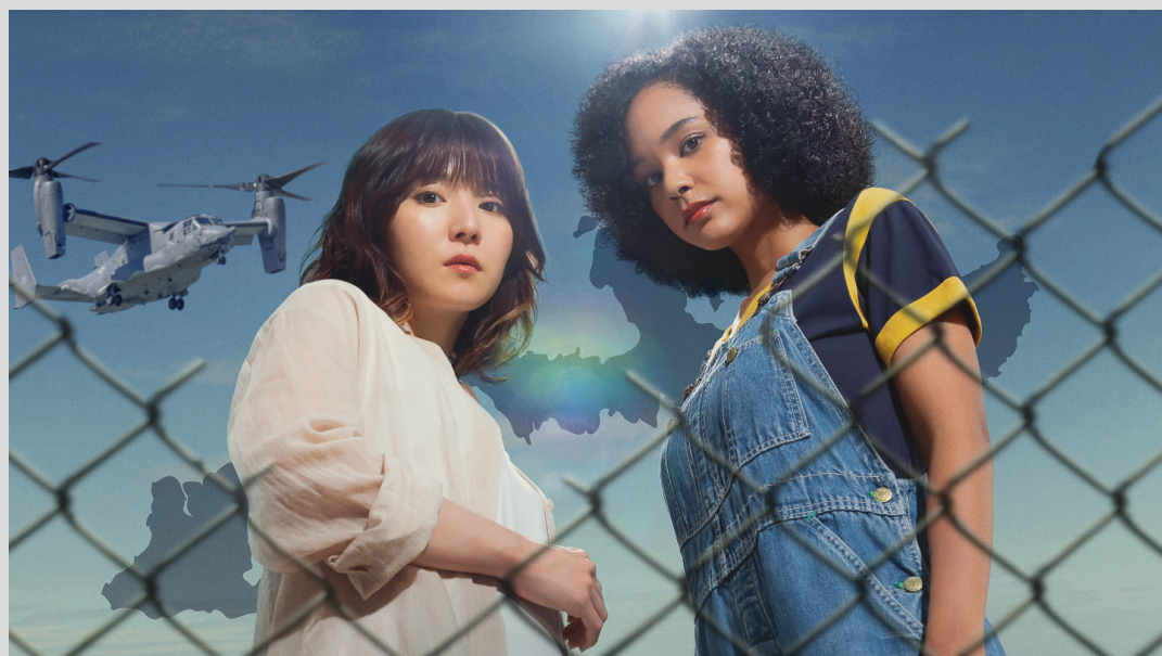
Serial Drama W "FENCE"