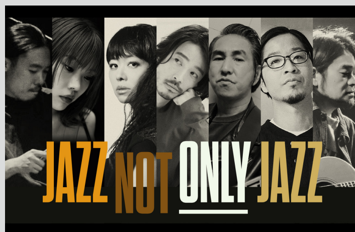
JAZZ NOT ONLY JAZZ