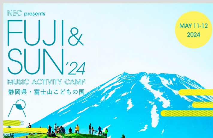
FUJI & SUN'24