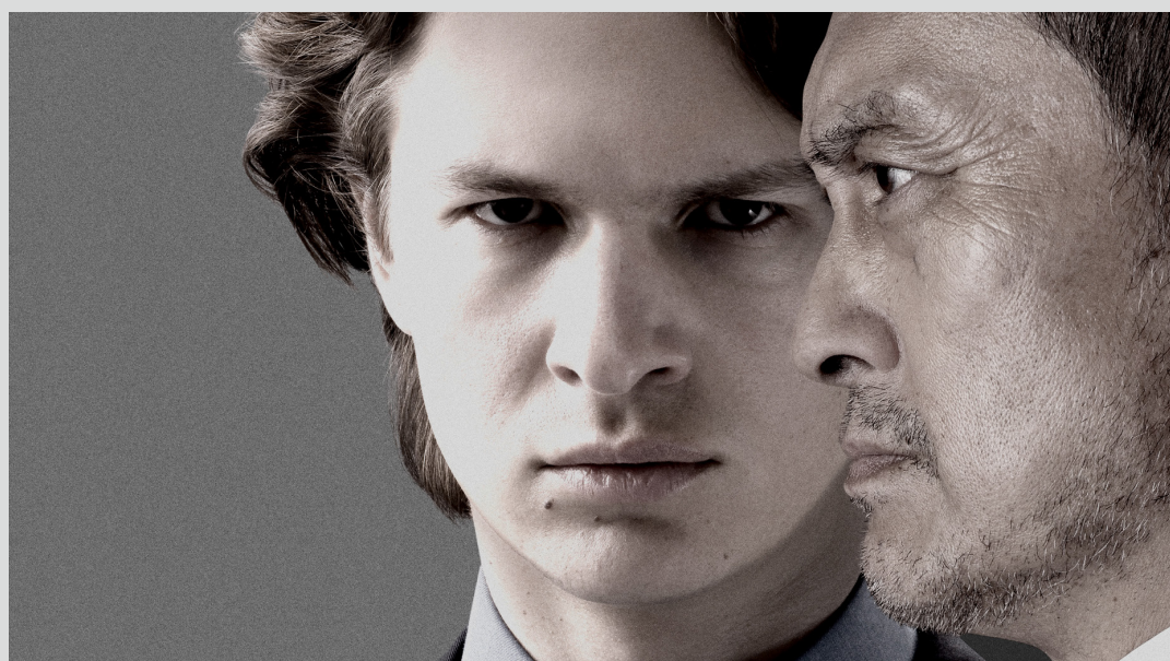
TOKYO VICE Season2

The epic drama series was co-produced by WOWOW and U.S. Max (formerly HBO Max). The highly anticipated Season 2 was broadcast in Japan and is being transmitted on these platforms exclusively. All 8 episodes of Season 1 are also available on WOWOW On-Demand.