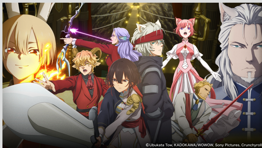
Bye Bye, Earth

Since WOWOW's first original animation "Brain Powerd" in 1998, we have brought numerous animation titles to life.