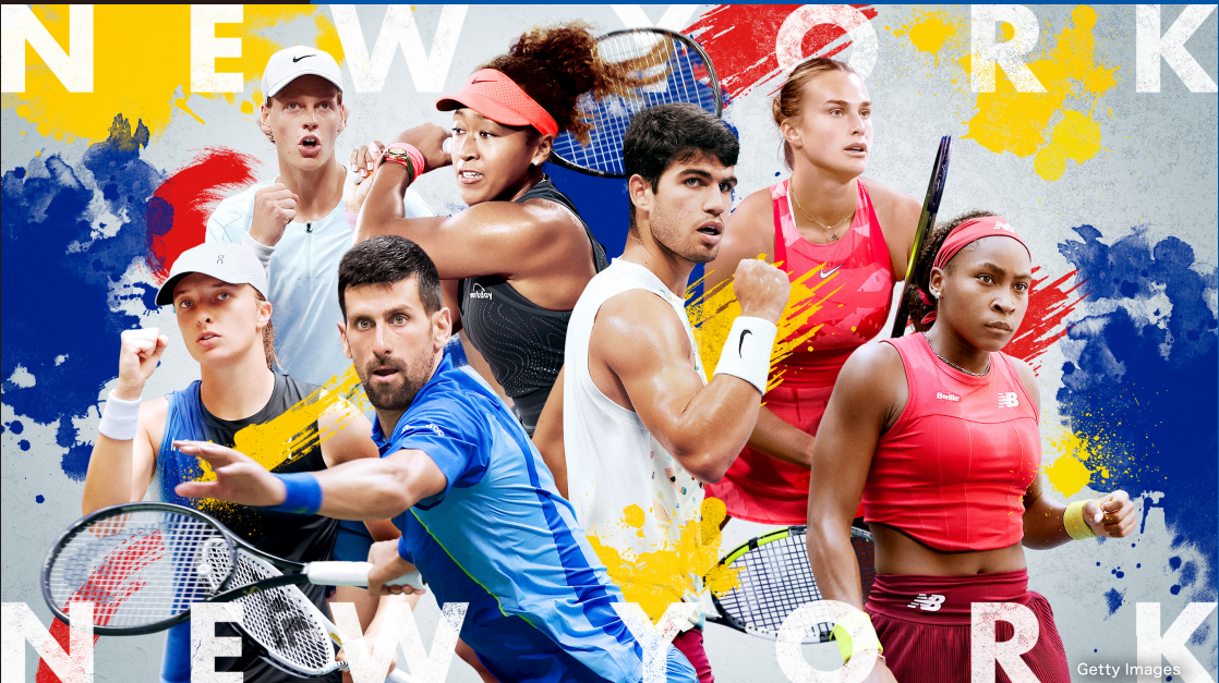
US Open Tennis Championships