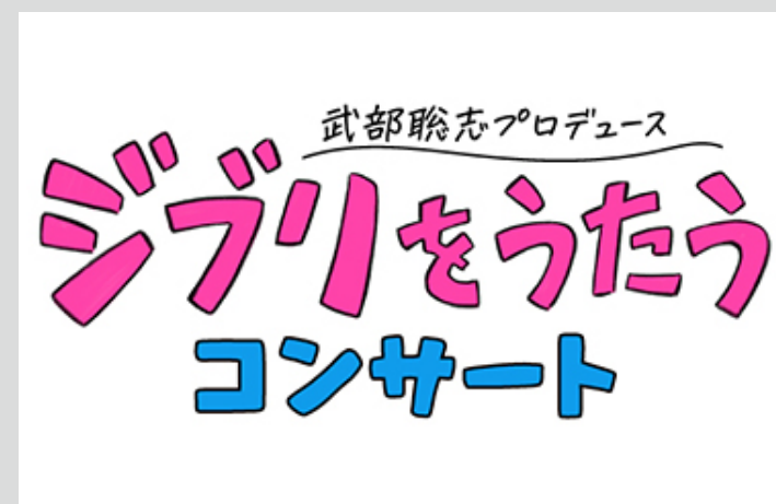
Ghibli Wo Utau [Sing Ghibli's songs] concert produced by Satoshi Takebe