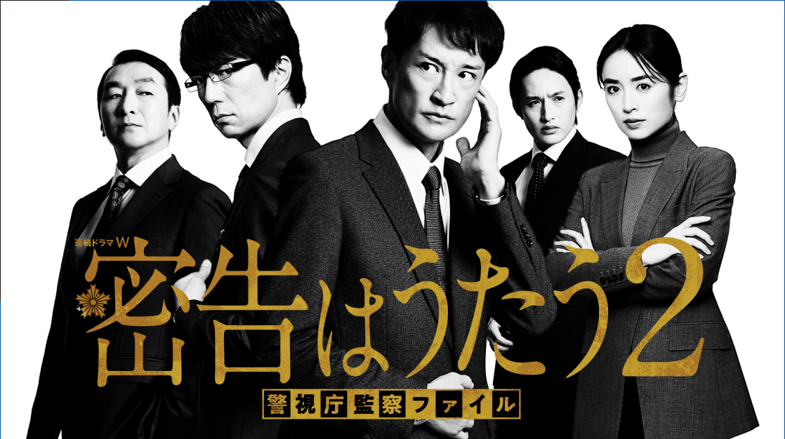
Serial Drama W THE SNITCH'S SERENADE Season2