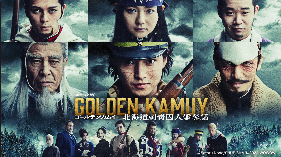
Serial Drama W GOLDEN KAMUY —The Hunt of Prisoners in Hokkaido—