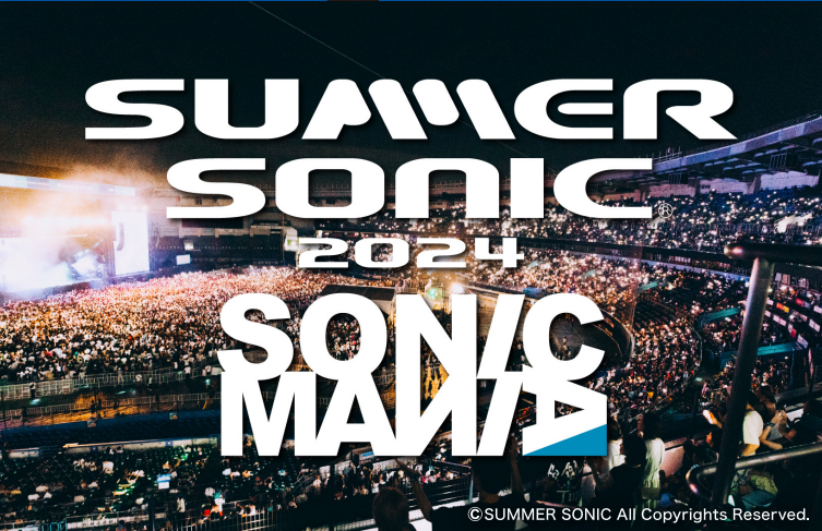
SUMMER SONIC 2024 / SONICMANIA